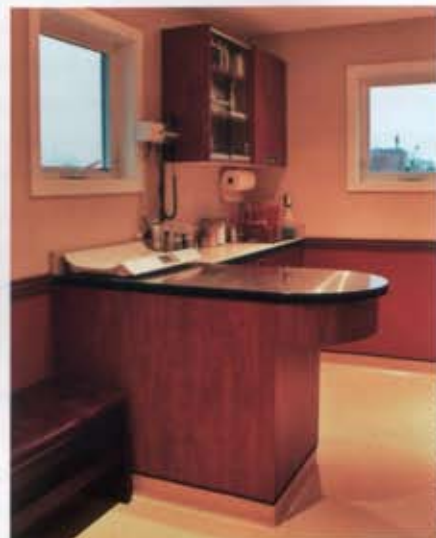
Right: Custom cabinetry by Complete Development Corp

Builder/Architect magazine is proud to feature Complete Development Corp. this month. Your philosophy to deliver exceptional service, combined with referrals from your clients and vendors have earned your company the highest respect. Your extensive experience in both residential and commercial sectors of building and construction has enabled you to provide consumers with professionalism and efficiency not normally seen in the industry. ■