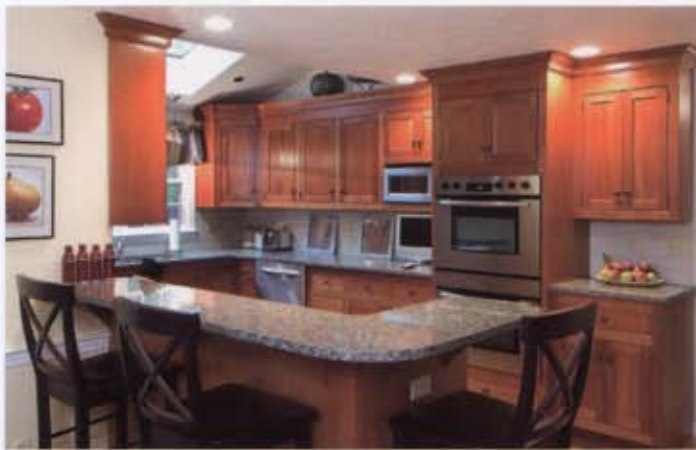
Cherry kitchen features state-of-the-art appliances from A & D Appliances.