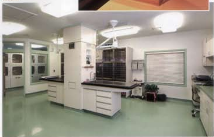
Below: Surgical Room